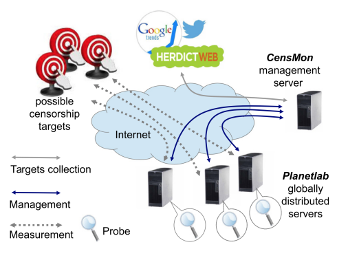
Figure 2: The Censmon architecture model diagram explained by Aceto et al. [16]

1. A DNS resolution request is made to the URL under consideration. After attempting resolution, the IP results of the resolution along with any errors such as